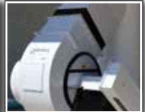
Air Handling & Scrubbing