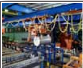
Plating Barrels & Spin Dryers