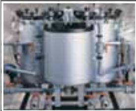
Filtration Systems, Media & Parts