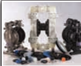
Pumps & Parts