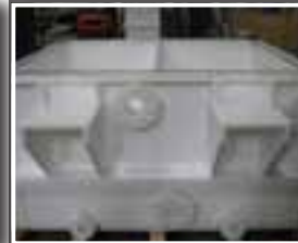
Tanks, Liners & Tank Repairs